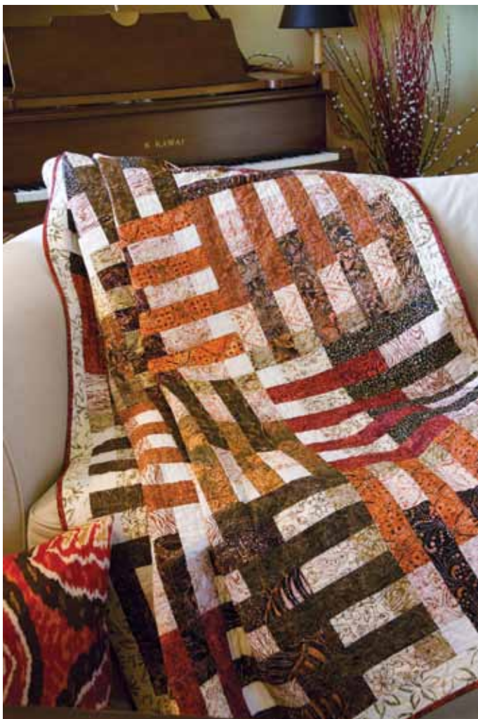
The lap size (52½" x 68½") version of Nutmeg & Cinnamon is patterned in the July/August 2015 issue of McCall's Quilting ; pattern also available at QuiltandSewShop.com .